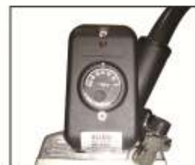
Easy Temperature Adjustment For Precise Finishing