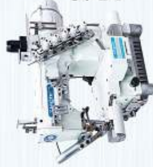
CTD9611-0-356M/UCE-D 電動式自動切線裝置(細筒型繃縫機用) Electric Type Thread Trimming System (For Small Cylinder Bed Coverstitch Interlock Machine)