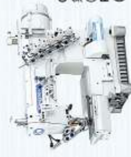
CTD9000-0-356M/UCP-B 氣動式自動切線裝置 (方筒型繃縫機用) Pneumatic Type Thread Trimming System For (For Cylinder Bed Interlock Machines)