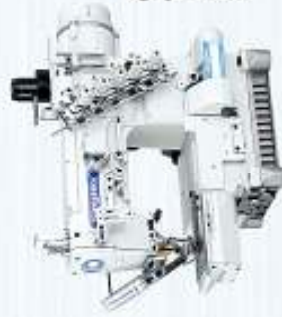
CTD9000-0-356M/UCE-B 電動式自動切線裝置(方筒型繃縫機用) Electric Type Thread Trimming System (For Cylinder Bed Interlock Machines)