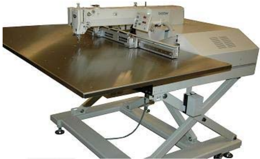
( BAS-342GXL Model Shown )